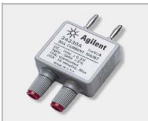
34330A 30A Current Shunt

Experience the new 34405A Digital Multimeter.