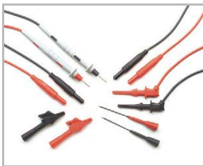
34132A Deluxe Test Lead Kits