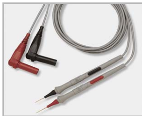
34133A Precision Electronic Test Leads