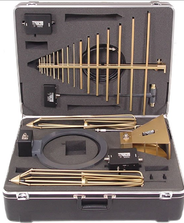
Shown with optional preamplifiers