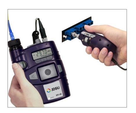
FBP Probe with HP3-60-P4 Fiber Inspection and Test System