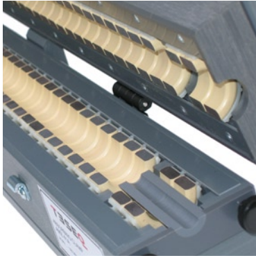
AMZ 41A, side view