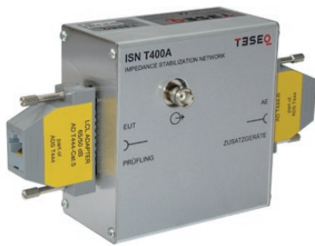
Basic network ISN T400A with connected LCL cat.5 adapter with pin-arrangement T444 and adapter for arranging AE port (part of ISN T4A and ISN T444A)