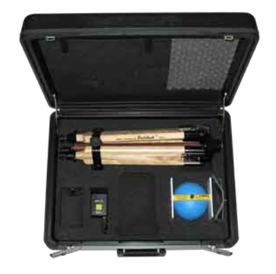
KSQ 1001 in suitcase