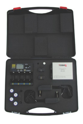
RSG 2000 with battery charger and power supply unit in suitcase