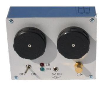
RSG 2000, front panel